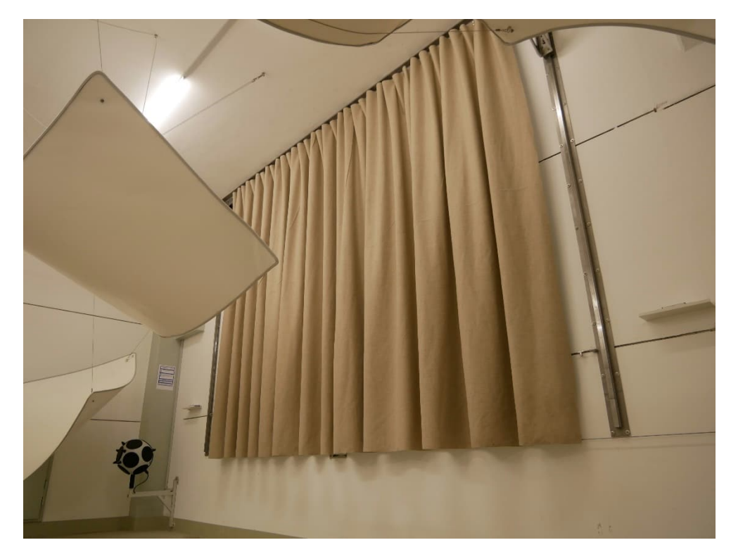
Figure B.2. Test object mounted in the reverberation room, diagonal view.